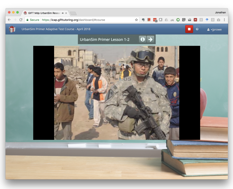
Figure 1: Screenshot of UrbanSim Primer training video presented in GIFT.

We have designed an adaptive hypermedia-based training course based on the UrbanSim Primer using a branch of GIFT Cloud that supports recent enhancements to the GIFT EMAP to support ICAP-based instructional remediation functionalities. The course builds upon the doctrinal lessons presented in the UrbanSim Primer and includes a series of short videos, instructional texts, quiz questions, remedial content, and glossaries related to the fundamental principles of COIN and stability operations. Trainee experiences with the COIN training course proceed as follows.