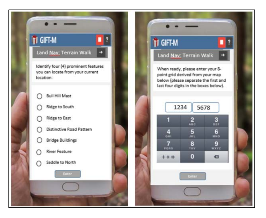
Figure 3. GIFT Mobile App Example Interactions for Terrain Walk

trigger training events in a live environment through the delivery of contextualized content, tasks and assessments (Goldberg & Boyce, 2018). The notion here is to extend the training space into the actual operational environment and embedding structured learning activities that utilize the elements of the space they are occupying. As an example, the first mobile application being developed is to support an exercise called a Terrain Walk. During this exercise, a trainee completes a specified course where designated spots along the path are used to train directed concepts that associate with land navigation fundamentals. In the traditional sense a Terrain Walk is completed by a live instructor with a group of trainees. To support a selfregulated delivery approach, the idea is to replace the instructor with a smart phone, where each trainee receives a personalized experience.