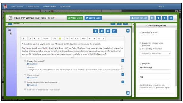
Figure 2: Human authors create questions, the system selects questions to display and calculates scores

administration. Now, the GAT is moving toward an automated process by which these sums are calculated on-the-fly and dynamically update when changes are made to the survey content. This seemingly superficial change significantly reduces the possibility for display and/or scoring errors during runtime.