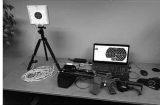
Figure 1: The Experimental System. Pictured from left to right are the target, the weapon, the software and the physiological sensor systems.

instruction. This generalized approach is used to be able to quickly construct and use ITSs in an experimental fashion.