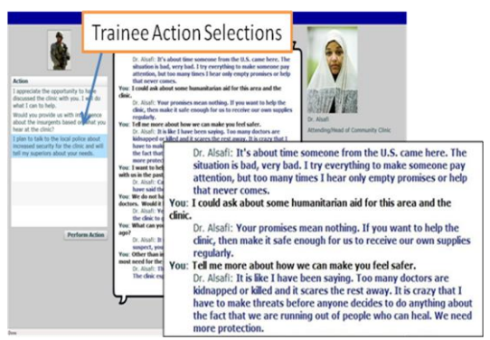
Figure 2. Screenshot of Cultural Meeting Trainer (CMT) Trainee Interface

resulting study was conducted using the Cultural Meeting Trainer (CMT), a web-based flash system prototype applied for cross-cultural interaction training. The CMT (see Figure 2) is based on the U.S. Army's Bilateral Negotiations Trainer, an immersive virtual environment that allows practice and execution of face-to-face negotiations with virtual humans that include cultural models (e.g., Iraqi Culture) (Kim et al., 2009). The CMT is specifically designed to facilitate the training of cross-cultural norms and customs associated with conversation and discussion leading up to negotiation. Subjects interact with CMT characters through a bank of dialog selections used for progressing story paths.